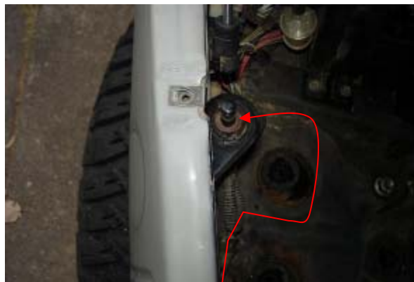
3.19 On the LTD models, there is a 'Bonnet Alarm' pin located on the inner guard.