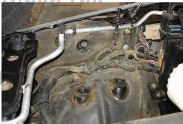
3.20 Remove the air box