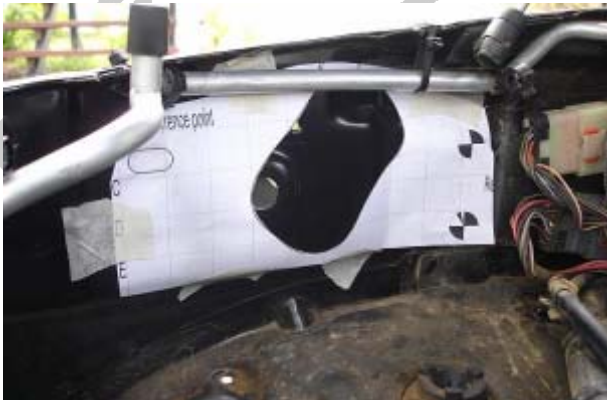
3.27 Using the inner template, line up the reference points