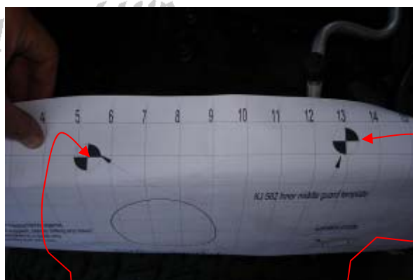
3.24 And tape the template