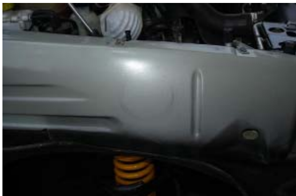
3.18 To allow the drilling through the additional panels, remove the external panel / fender