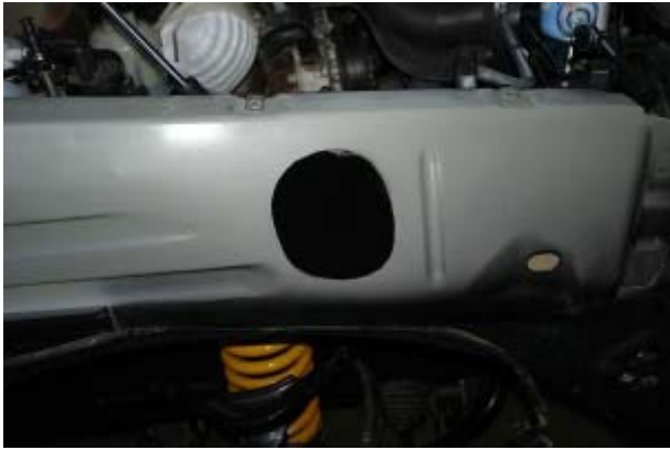
3.25 Mark and cut the hole