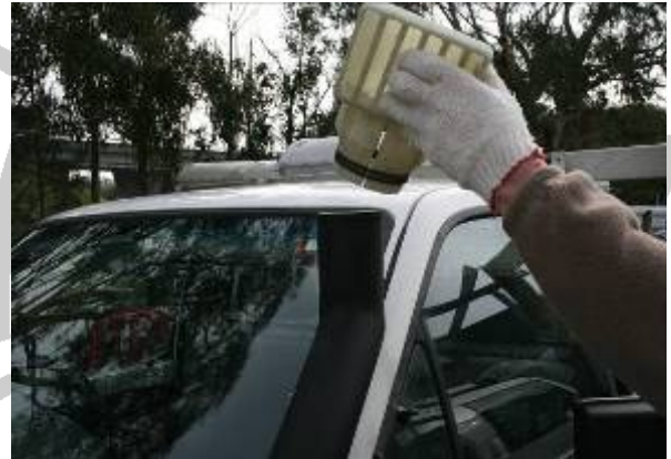
4.4 Re-install the Air ram SP063