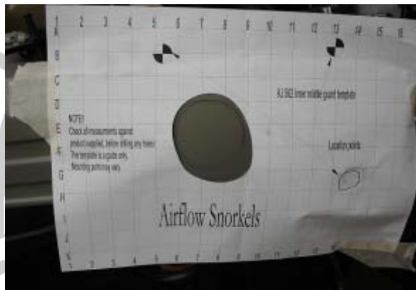
3.22 Cut the hole as marked