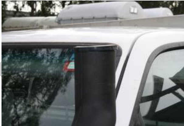
4.3 Air sock should neatly fit into the top of the snorkel body