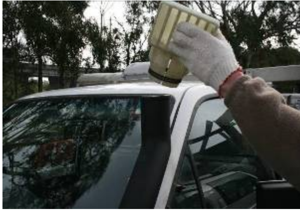
4.1 Remove the Air Ram SP063