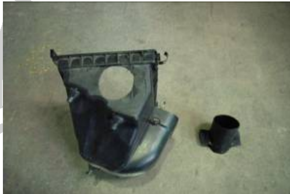
3.30 To prepare the air box, place the template over the air box using the trim line as a guide