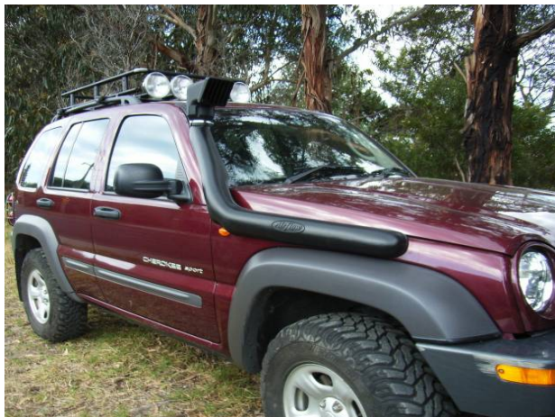
4.7 Polish with silicone cleaner