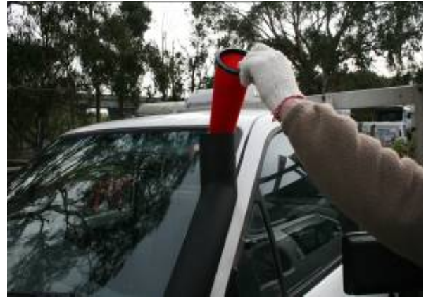
4.2 Install Pre-cleaner filter sock SP065B