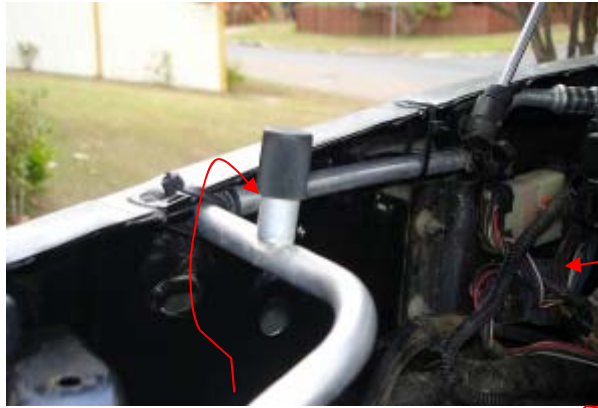
3.26 Unclip the air condition pipe and the wiring harness to allow easy access when cutting the hole in the inner guard