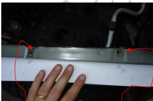
3.23 Use the inner middle guard template to line up of these points